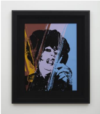
Andy Warhol Drag Queen (IIIA.2) , 1975 frame: 43 1/2 x 36 7/8 in., paper: 37 3/8 x 29 1/2 in. Unique Screenprint USD $60,000.00