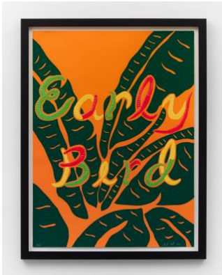
Joel Mesler Early Bird, 2020 frame: 44 1/2 x 34 5/8 in., paper: 40 x 30 in. 6-color screenprint on Stonehenge Fawn paper Edition of 40