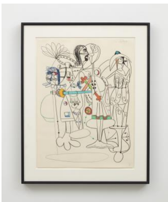
George Condo Untitled , 1992 frame: 30 1/2 x 24 1/4 in., paper: 24 x 18 in. Colored pencil and pastel on paper USD $125,000.00