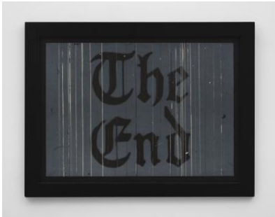
Ed Ruscha The End , 1991 frame: 34 3/8 x 44 7/8 in., paper: 26 3/16 x 36 5/8 in. Lithograph on white Rives BFK paper, Edition of 50 USD $50,000.00