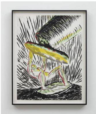
Raymond Pettibon No title (isolationism is not), 2004 frame: 26 1/8 x 20 3/4 in., paper: 24 x 18 in. Ink, graphite and watercolor on paper USD $85,000.00