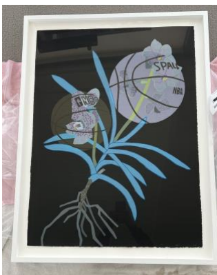
Jonas Wood Double Basketball Orchid 2 (State III), 2020 frame: 40 7/8 x 31 3/8 in., paper: 36 1/4 x 27 in. 24-color lithograph on Arches Cover Black, Edition of 30 USD $45,000.00