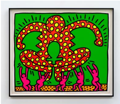
Keith Haring FERTILITY NO. 2, 1983 frame: 43 1/4 x 51 1/4 in., paper: 42 x 50 in. Screenprint on paper Edition of 100 USD $85,000.00