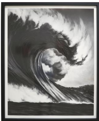
Robert Longo Dragon's Head, 2005 frame: 55 3/4 x 45 3/4 in., Image Size: 50 x 40 in., paper: 53 x 43 in. Archival pigment print on Somerset velvet paper Edition of 30 USD $24,000.00