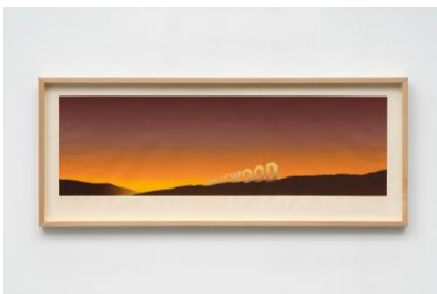
Ed Ruscha Hollywood , 1968 frame: 18 5/8 x 45 5/8 in., paper: 17 1/2 x 44 3/8 in. Screenprint in colors on wove paper, edition of 100 USD $250,000.00