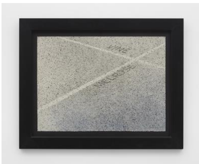
Ed Ruscha Vine / Melrose , 1999 frame: 30 1/2 x 38 1/2 in., paper: 22 1/4 x 30 1/8 in. two-color Lithograph on Rives Edition of 60 USD $20,000.00